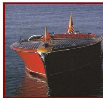
Inspiring! 18' Chris-Craft Riviera

The boat show schedule includes the WoodenBoat show in late June, an Antique and Classic Boat Show in July, and the Maine Boats, Homes &