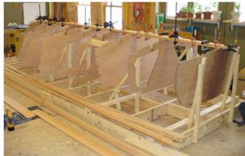
Callinectes Runabout 16 Under Construction

Hull number one, the prototype, is under construction with a scheduled splash date of June 1—in time for the 2008 Summer Boat Shows!