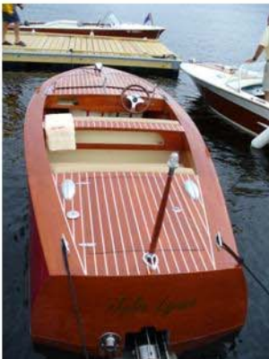
Naples Antique and Classic Boat Show

Fast boats, exquisite woodwork, smart design, and sturdy construction: some things never go out of style..