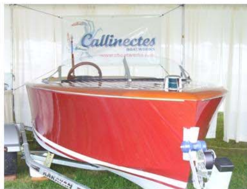
Maine Boats, Homes and Harbor Show