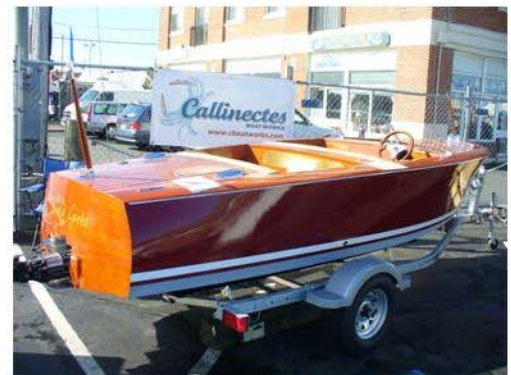
Newport International Boat Show