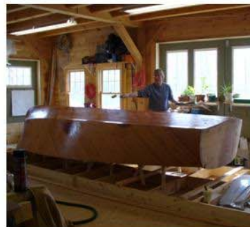
Winter 2007/08 Shop Activity

Of course there is much more to it than making a mold and grid system,